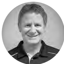
FINANCE DIRECTOR Blue Field